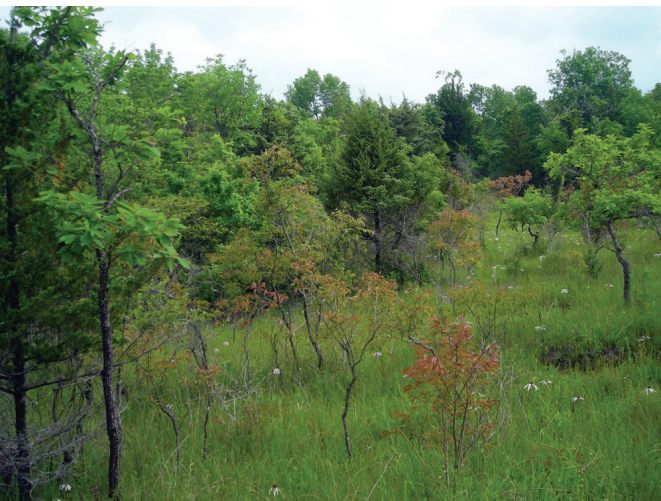
Blackland prairie at Terre Noire Natural Area (left). An example of how prairie transitions into savanna and woodland on cuestas at Saratoga Blackland Prairie Natural Area (right).