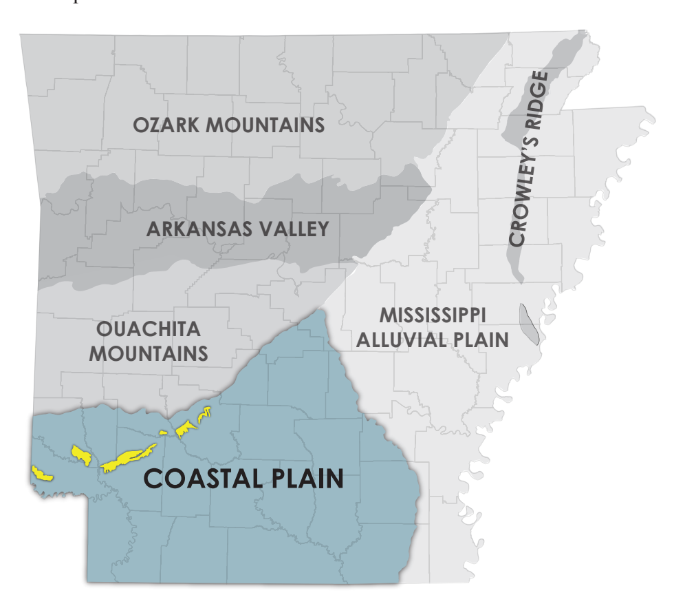
Original distribution (in yellow) of blackland communities in southwestern Arkansas.

To understand why the blackland prairie ecosystem is so rare in Arkansas, you must know a little about its geology. Millions of years ago, the Gulf of Mexico covered the southeastern United States. At one time, portions of southern and eastern Arkansas were on the gulf coast. The shallow waters in this part of the gulf were full of shelled creatures, and over time, their remains accumulated on the ocean floor forming a layer of soft limestone called chalk . In some areas, the shells mixed with ocean sediments to create marl , a layer of limey clay. Then as the Gulf of Mexico receded, deposits of gravel, sand and silt were often left on top of the chalk and marl.