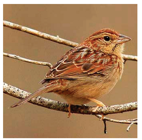
Male Diana fritillary (left), female Diana fritillary (center), Bachman's Sparrow (right).

For example, Bachman's Sparrow ( Aimophila aestivalis ) is a small songbird native to open habitats across the southeastern United States. Known to winter in Arkansas, it requires a dense ground layer of grasses and forbs, and an open understory with few shrubs. Bachman's Sparrow feeds by walking slowly across the ground searching for insects and seeds. It often jumps into the air to catch its prey. Frequent, natural fire is known to increase the forage preferred by this bird. The mosaic of blackland communities is also important to our state butterfly, the Diana fritillary ( Speyeria diana ). This butterfly breeds in deciduous/mixed forests and oak woodland/savanna where lots of violets ( Viola sp. ) can be found in the understory. Violets are its larval host plant. Adults feed in adjacent prairies and grasslands on the nectar of many different flower species.